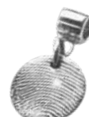
Circle | $394