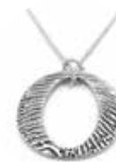
Eternity 20" $480