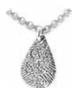
Teardrop 20" $430 | 24" $544