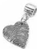
Heart | $394

The sterling silver charm carrier fits Pandora bracelets.