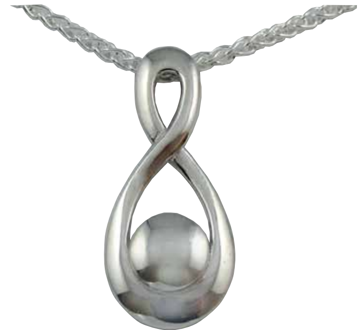
P79/ P79Y9 — 30mm H x 13mm W

$205 ( P78 Sterling silver with chain) $475 ( P78Y9 9ct yellow gold with sterling silver chain)