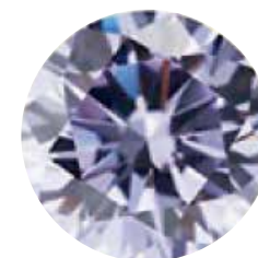
June Lavender Alexandrite Stone