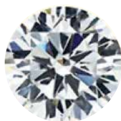
April White Diamond Stone