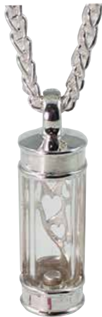
P67 — 43mm H x 12mm W