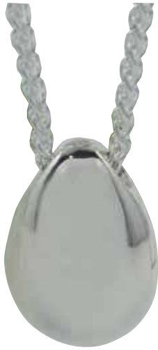
P74 — 24mm H x 17mm W