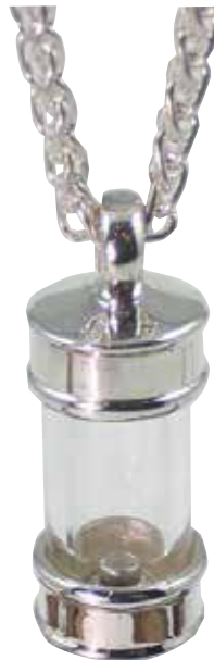
P68 — 36mm H x 14mm W