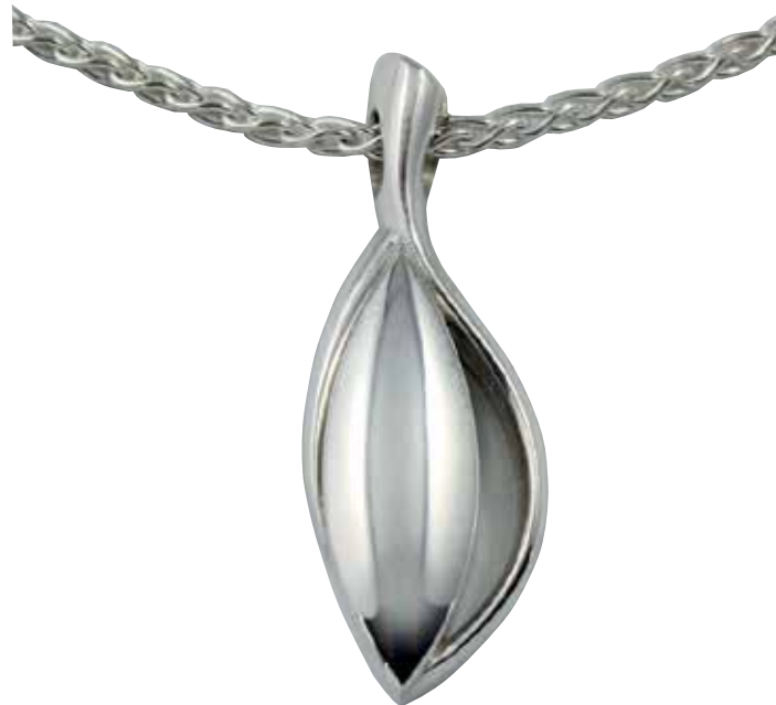
P78/ P78Y9 — 28mm H x 10mm W

$205 ( P78 Sterling silver with chain) $475 ( P78Y9 9ct yellow gold with sterling silver chain)