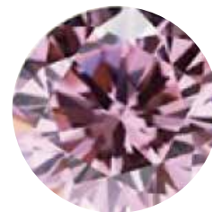
October Pink Tourmaline Stone