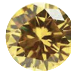
November Yellow Citrine Stone