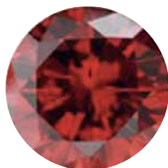
January Red Garnet Stone

$POA ( P200Y9D 9ct yellow gold with sterling silver chain – Diamond)