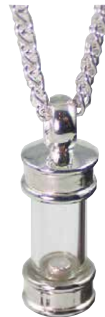
P73 — 35mm H x 10mm W