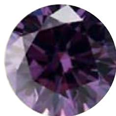
February Purple Amethyst Stone