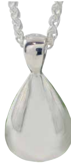
P76 — 30mm H x 16mm W