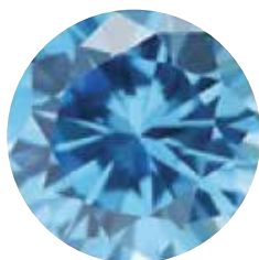
March Light Blue Aquamarine Stone