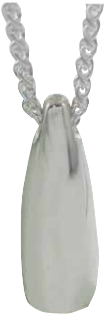
P77 — 34mm H x 12mm W