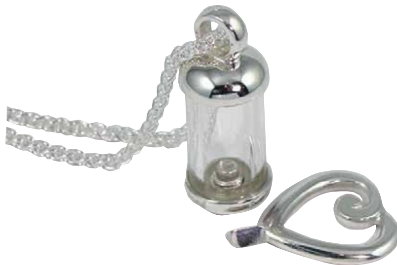
P70 — 36mm H x 14mm W