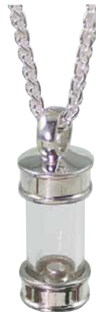
P69 — 36mm H x 12mm W