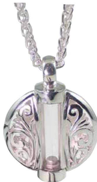
P71 — 40mm H x 30mm W