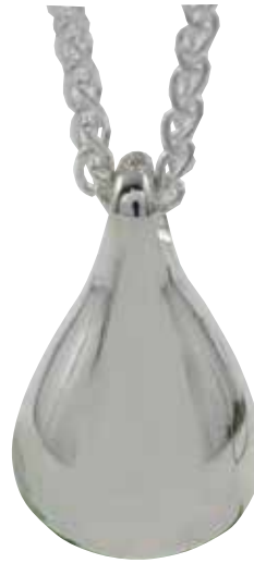
P75 — 30mm H x 16mm W