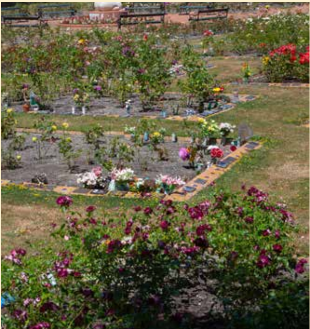
Seaforth Garden, Karori Cemetery

There is an out of district fee of $1,123.00. After hours charges may apply.